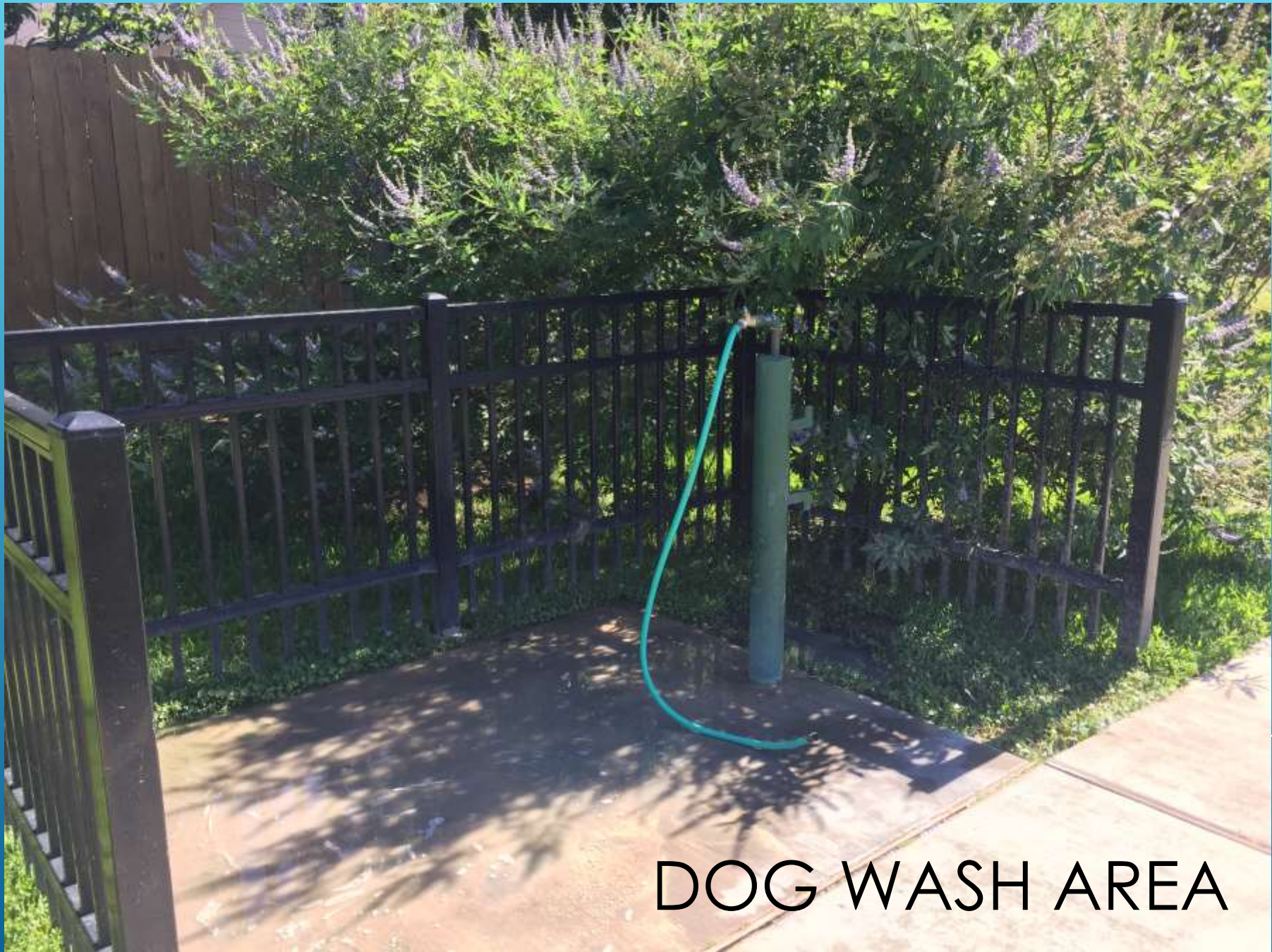
DOG WASH AREA