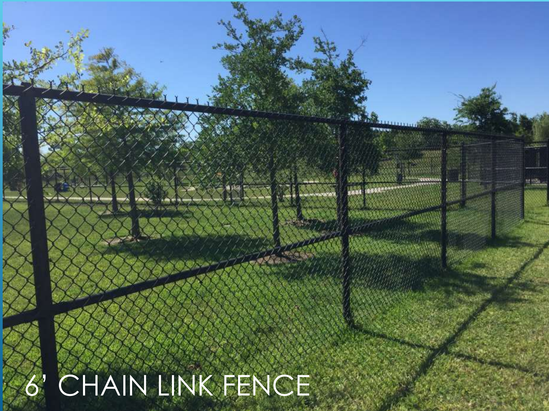
6' CHAIN LINK FENCE